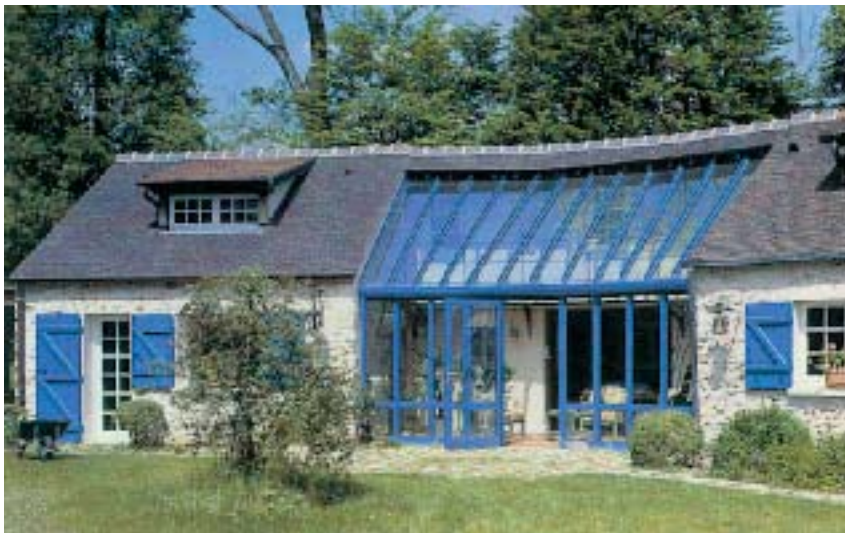
Aluminium veranda, windows and blinds

Intelligent facades incorporating aluminium systems can decrease energy consumption in buildings by up to 50%. The key feature of these intelligent buildings is their constructive interaction with the exterior, markedly reducing heating, cooling, ventilation and lighting energy demands. This is achieved through numerous techniques and processes including photovoltaics, optimised ventilation mechanisms and appropriate light and shade management.