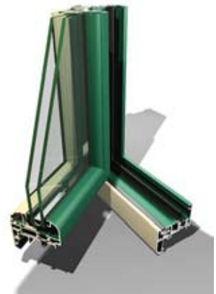
Thermally-broken & bi-colour aluminium window.